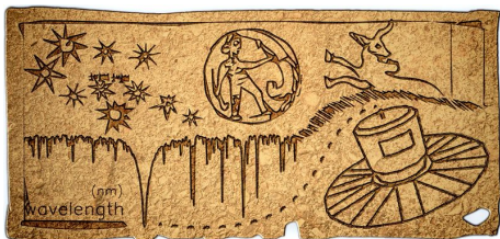
Gaia and the dynamics of the Milky Way