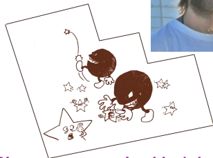
Binary supermassive black holes